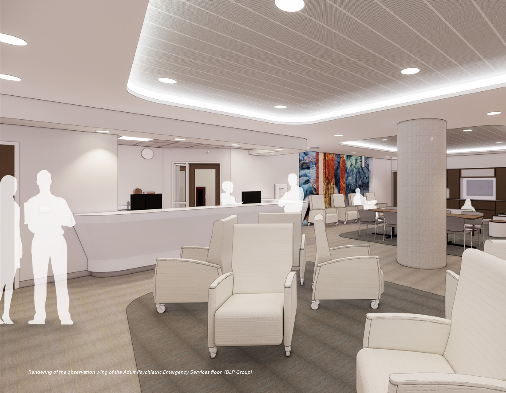
Rendering of the observation wing of the Adult Psychiatric Emergency Services floor.