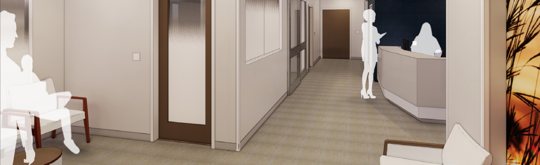
Rendering of the waiting room for the Adult Psychiatric Emergency Services floor. (DLR Group)

The facility's design is a blend of the most evidence-based models from around the country tailored to meet the needs of Nebraskans. The environment, policies and procedures will ensure the physical and psychological safety of patients and families. Certified peer support specialists, individuals who have experienced a mental health disorder and are trained to assist others, have been providing input on the design of the Adult PES to ensure it treats each person with dignity. The Adult PES will be trauma-informed from the initial interview to the ongoing training of all providers and staff.