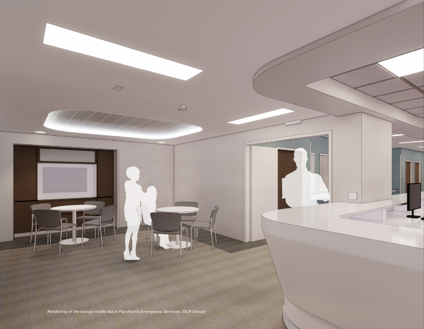
Rendering of the lounge inside Adult Psychiatric Emergency Services. (DLR Group)