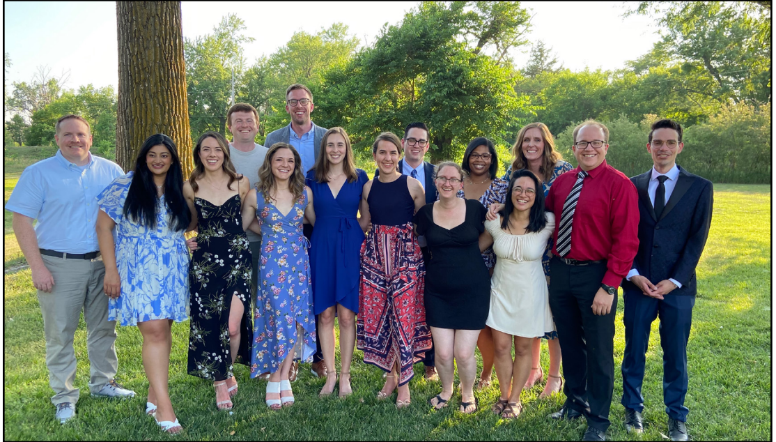
Department of Family Medicine 2023 Resident Graduates