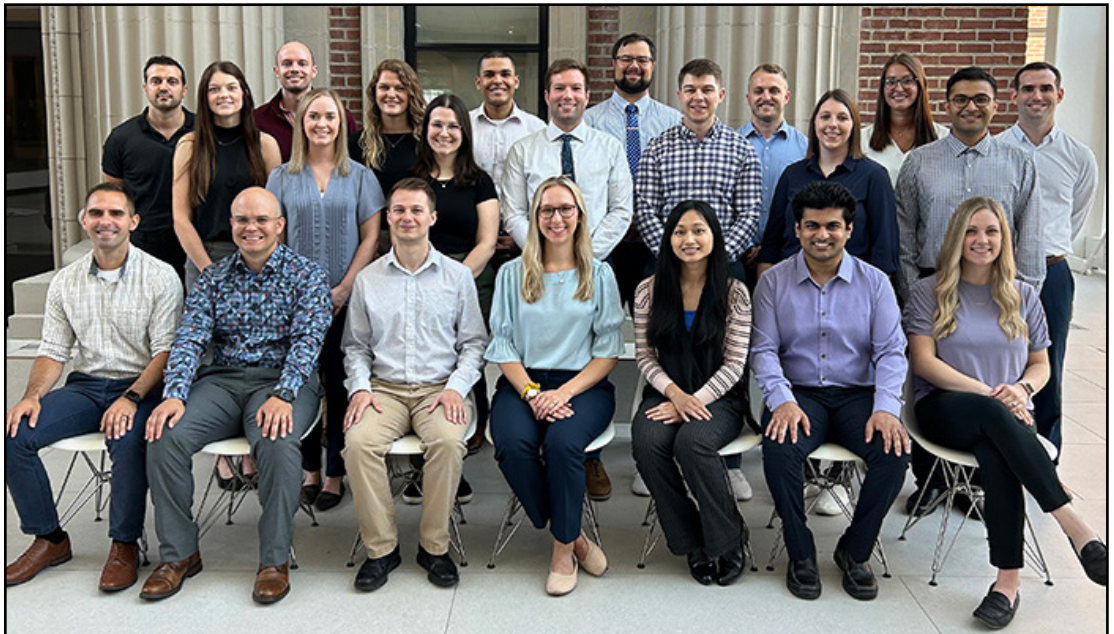
Department of Family Medicine 2023 incoming residents